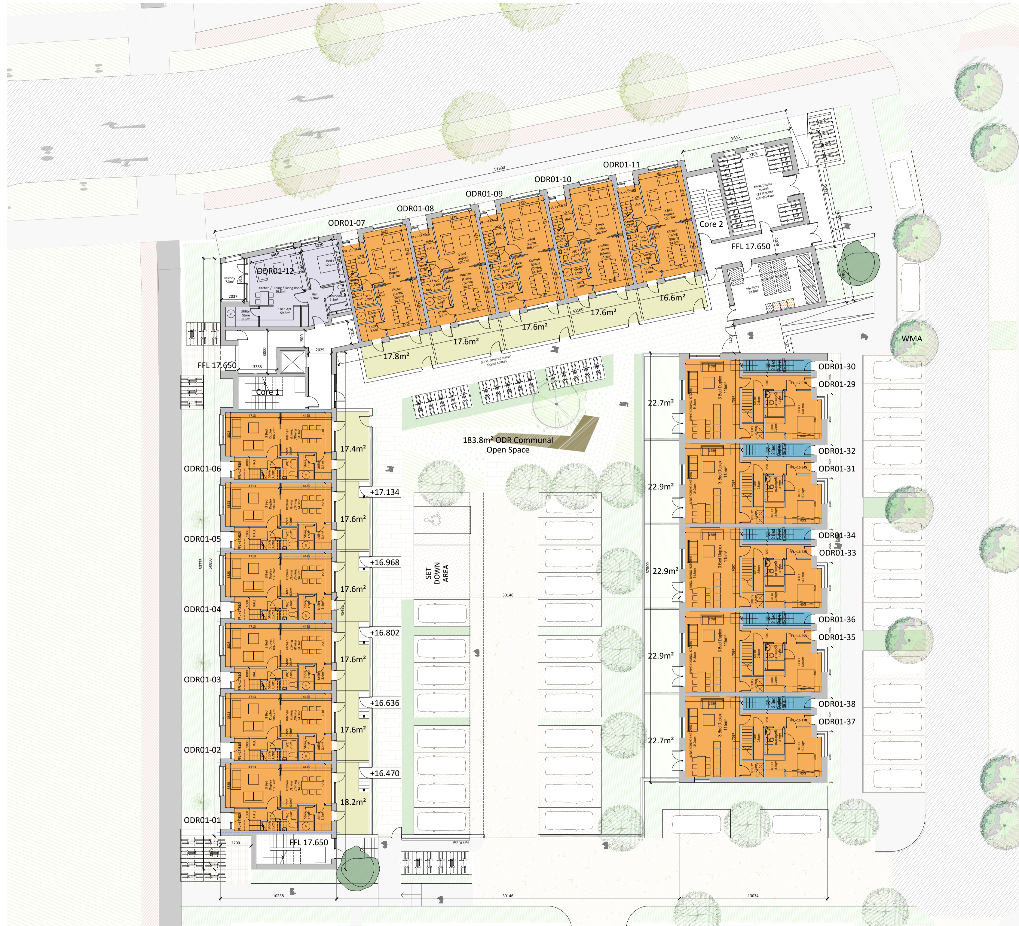
ODR Level 00